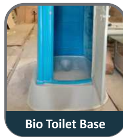
Bio Toilet Base