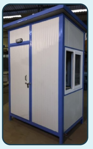
Material - MS / FRP / PUF / customised sandwiched core material with Dual FRP layers for corrosive environments